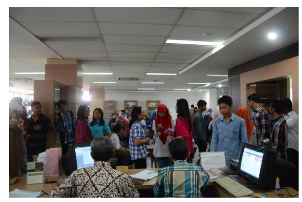
Figure 3: Socialization of ITS Library