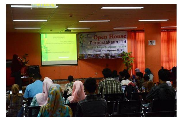
Figure 2: Socialization of e-journal

Previously, the use and utilization of scientific literature, especially e-journal is still dominated by a further generation students, postgraduate students, and also professionals in their respective fields. Still a bit new student role in exploiting one of the scientific references. With the strategy of promotion of library services through the "Open House" could improve the information literacy of students regarding e-journals subscribed by ITS Library as a scientific reference. This is evident from the enthusiasm of the participants that the majority of new students participated in socialization of e-journals and the number of participants who asked the question and answer session took place. In this event, librarian emphasize that higher education environment should use scientific resources. Based on observation authors, this way is worked. Mostly, after Open House, new student ask about brochure list of e-journal that subscribed by ITS for doing their task.