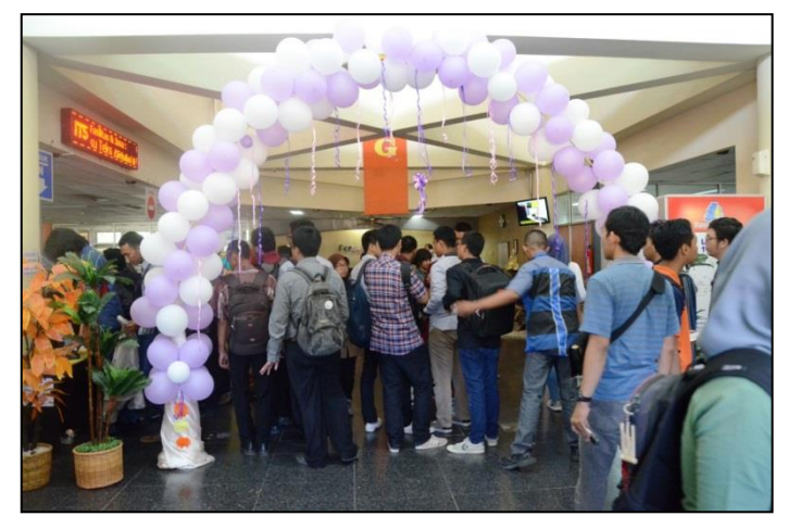
Figure 1. The participants of "Open House" at ITS Library

Currently the market share of the library ITS is dominated by the Net Generation. In this generation, they grew up with technology that has advanced the conditions in which the gadgets into a commodity that is very important in everyday life. So also in getting the required information, enough through software they have, and the results can be obtained instantly. With this phenomenon, library ITS seeks to draw on and provide quality and best service facilities and qualified to be used by the user. Started with the creation of a comfortable room, procurement of teaching a complete collection, as well as a recreational facility with a function that is able to refresh the mind and spirit of the belly in ITS. Therefore we need the means or the appropriate promotional strategies that resources and existing facilities can be used optimally. In addition, through socialization, expected reliance to utilize library facilities are also increase.