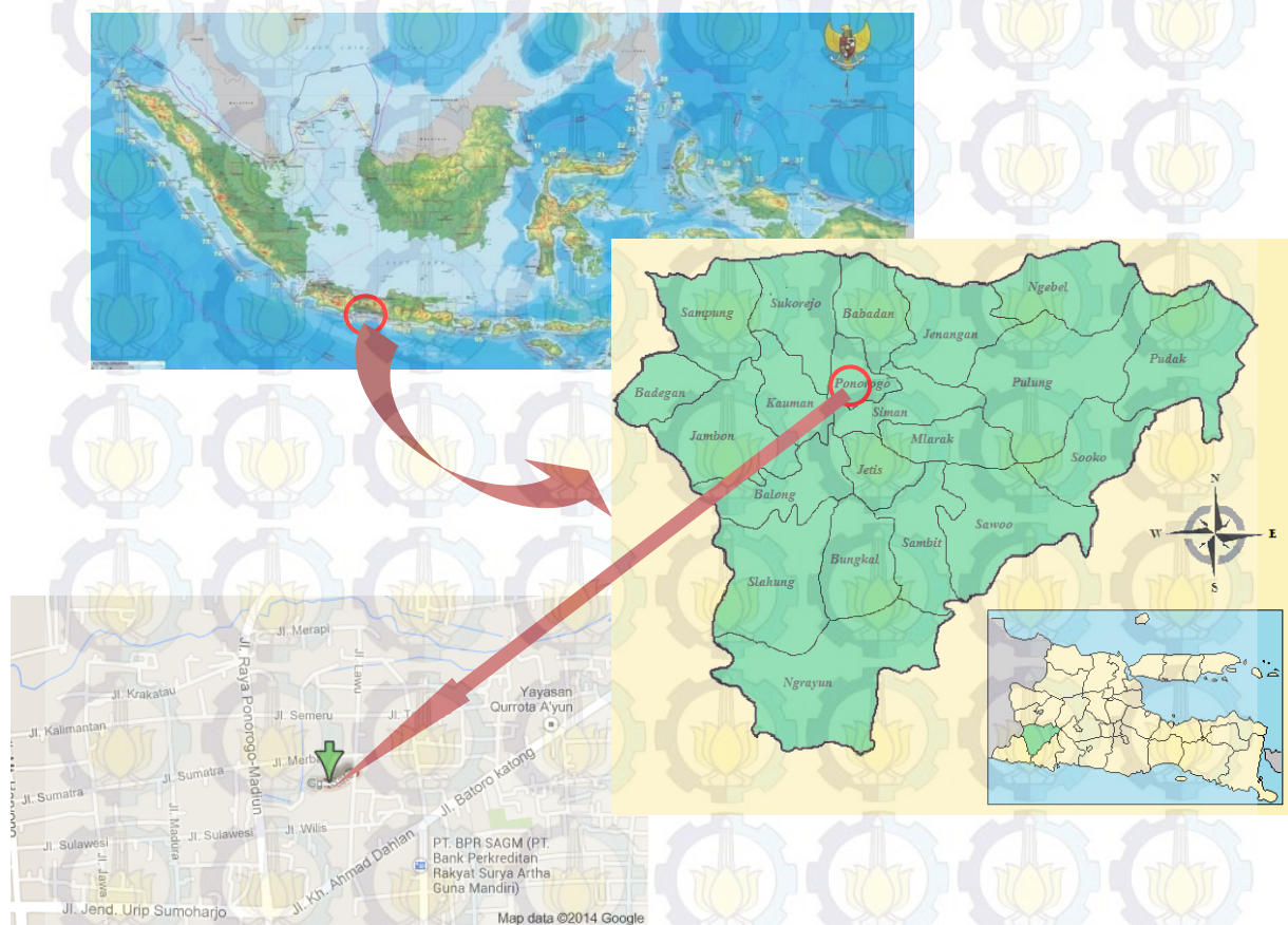
Figure 1 The Location of Kampung Sate

This research will be conducted in Kampung Sate, Lawu Street I, RT 4, RW 5, Nologaten, Ponorogo Regency, East Java Province, Indonesia. The study area is all area in Kampung Sate Ponorogo in that street. The research location can be seen in figure 1.