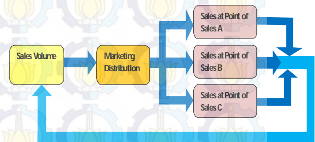
Figure V-3 The interconnection between total sales volume and sales volume at each point-of-sales

The Monte Carlo simulation is for predicting sales volume, one of the key determinants in analyzing profits in KUD Milk Agribusiness Dau. As the commodity itself, fresh milk, has limited shelf-life, the appropriate profit-maximizing strategy is to exploit sales potential of each point-of-sales.